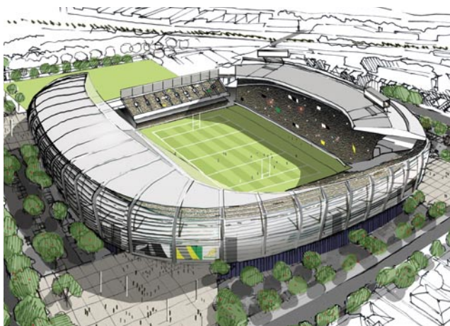
Artist's impression of the preferred design for Eden Park. View from the south-east corner looking towards Kingsland.

As I noted in the last edition of Commentator , our designers have been hard at work incorporating community feedback into the design. Specific attention has been given to issues that we acknowledge are of concern to the local community – the visual impact of Eden Park, improving public transport use, traffic management, noise and light, pedestrian movements to and from games and better integration of Eden Park with the community.